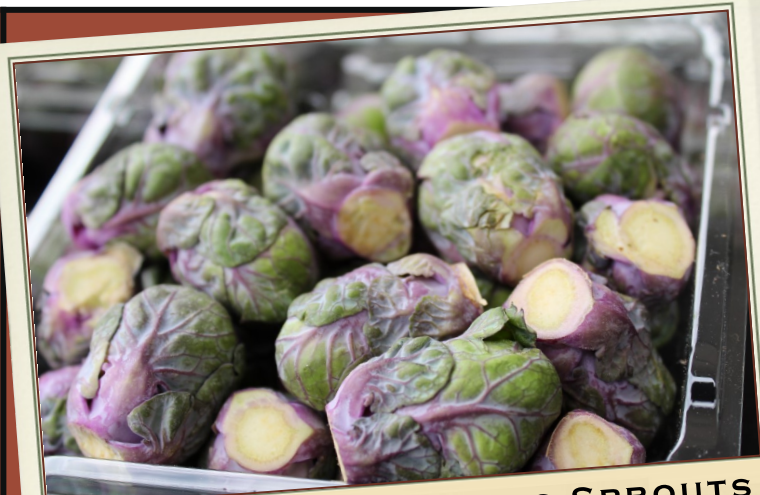
BABY PURPLE BRUSSELS SPROUTS

Chocolate Fish Coffee Roasters is a favorite among local coffee aficionados. With two locations in Sacramento, Chocolate Fish is committed to roasting and serving the freshest possible coffee while maintaining the essential flavors within the bean. They travel to various growing regions to meet producers and learn about their growing practices. Freshness is very important to ensure a good roast which is why Chocolate Fish sources beans that have been harvested within the last 12 months. They roast to bring out sweetness and acidity. We proudly offer the following: Espresso (Brazil) – semi-sweet, dark chocolate with notes of caramel and subtle orange acidity, finishes with a lush creamy mouth feel. 5# case; available whole beans or ground. Brazil – dark berry sweetness, medium acidity with a chocolate finish. 5# case; available whole beans or ground. Decaf (Santa Lucia, Mexico) – stonefruit sweetness, low acidity, buttery body and brown sugar aftertaste. Chocolate Fish is an avid supporter of the Sacramento community from participating in countless events to giving their coffee grounds to Re-Soil Sacramento to be used in community gardens in the city.