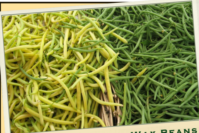
GREEN AND YELLOW WAX BEANS

This week we are pleased to offer a variety of summer squash from Maciel Farm located in Gridley, CA. Summer squashes vary in color, size and shape—all have tender flesh and skin, mild, buttery flavor and high moisture content. Summer squash should be bright with color and heavy for their size. In addition to Italian Squash (Zucchini), Maciel Farm will be supplying us with the following varieties: Gold Bar -Similar in shape to zucchini, bright yellow skin and white flesh. Fewer internal seeds results in a sturdy squash perfect for saute' or grilling. Straightneck -This is a variety of summer squash with bumpy, yellow skin and sweet flesh. Its name distinguishes it from its close relative, the Crookneck squash. Sunburst & Summer -Bright yellow (sunburst) and light green (summer) squash. Round and scalloped with crimped pie-like edges. Case only Grey -Also known as Mexican squash. Grey-green in color, shorter and more rounded than zucchini with sweeter flavor. Case only. 'Toy Box' Mixed Case of all varieties also available.