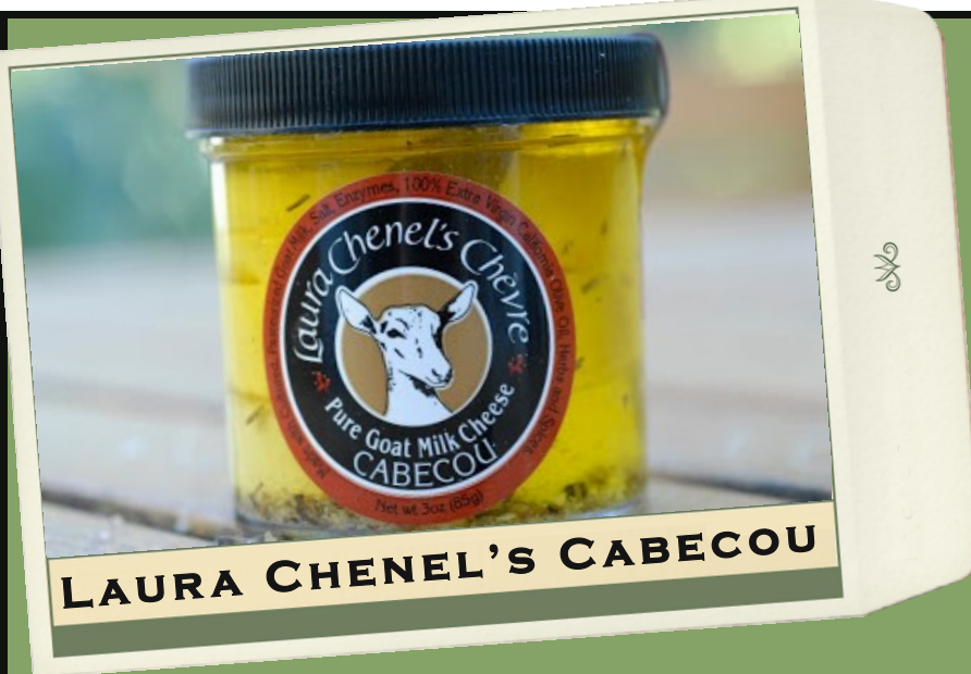
LAURA CHENEL'S CABECOUCO

The California asparagus harvest begins in late February, supply peaks in March and April, then tapers off in May. Nearly 75% of the 200 million pounds of fresh asparagus grown in the United States comes from California. Due to increasing competition from countries with lower production costs, California asparagus acreage is down from 36,000 acres in 1990 to just 11,000 acres being planted this season. Harvesting asparagus is extremely labor intensive-the tender spears must all be cut by hand when approximately nine inches long. Growers pack fresh asparagus in sheds located near the fields and send it to market within hours of packing. Specially designed crates and boxes are used to maintain freshness and protect asparagus from damage. The local Sacramento Delta Asparagus crop should be ready to harvest in a couple of weeks. We are now offering California grown Asparagus in 28# cases. Sizing is limited to Standard and Large at this time. $61.75. Also available by the pound.