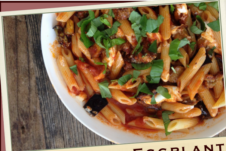
PENNE WITH EGGPLANT

Stillwater Orchards is a long established farm next to the Sacramento River in the town of Courtland. The region is known to produce some of the best pears in the world. The Bartlett pear is the nation's leading pear variety and counts for 75% of the California harvest. We are currently offering several varieties from Stillwater Orchards: Bartlett -Delta Bartletts are classic summer pears-sweet and juicy with buttery flesh and distinct aroma. 40# case or pound. Stark Crimson -This colorful red pear has the same characteristics as the Bartlett. When fully ripe, the skin is at its brightest. 20# case or pound. Seckel -An excellent dessert pear, small in size but big on sweetness. Skin does not change color but softens around the stem when ripe. Great served with cheese or baked into tarts. 20# case only. Bosc -The most popular dessert pear, excellent for baking. The Bosc pear shows no skin color change during ripening, but shrivels at the stem instead. 40# case or pound. French Butter -Juicy, buttery flesh with hints of lemon. A great baking pear. 20# case only. *Coming Soon-Comice -Its very juicy-creamy flesh has a winey aroma and is one the sweetest and juiciest pear varieties.