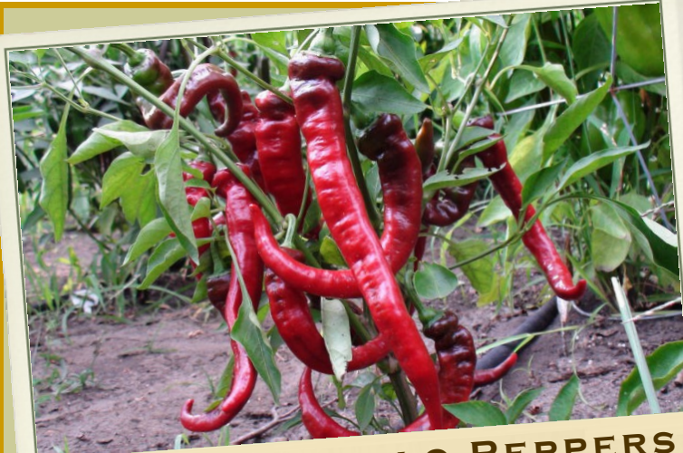
JIMMY NARDELLO PEPPERS

Jimmy Nardello -Peppers are red, long, and conical in shape with mildly sweet flavor; excellent for frying. Used in Italian cooking in pasta, pizzas and salads. 10# case. Riverdog Farms