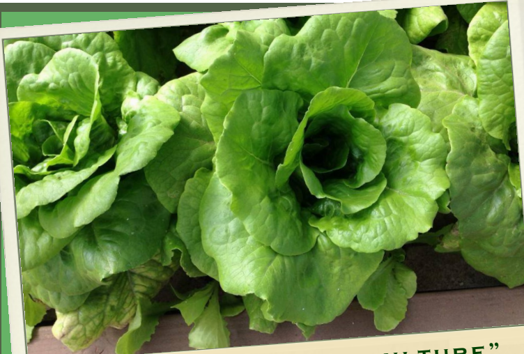
“THE FUTURE OF AGRICULTURE”

This month we introduce two new local products. Aquaponic Butter Lettuce from Viridis Aquaponics in Watsonville and Heroes Greek Yogurt from Sierra Nevada Cheese Company in Willows (Chico).