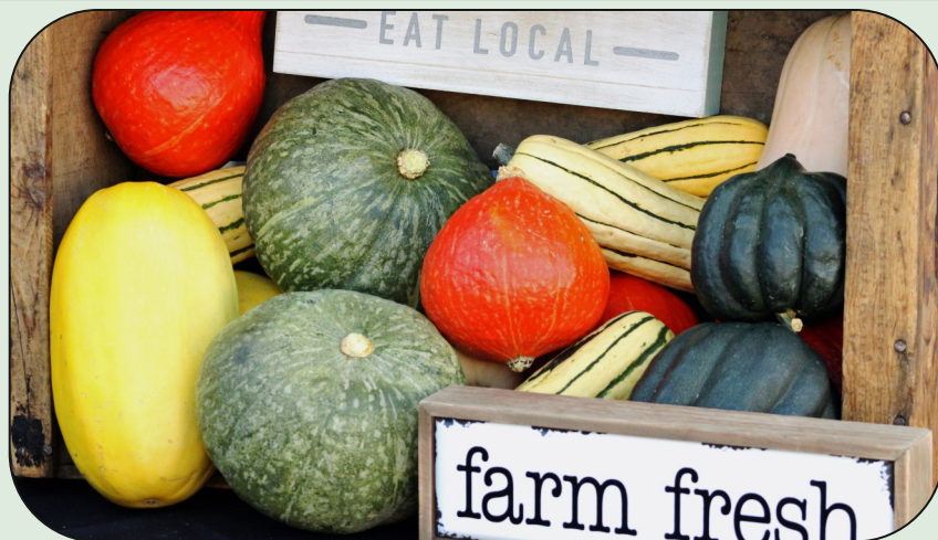
UNCLE RAY YEUNG • WEST SACRAMENTO