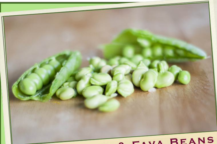
ENGLISH PEAS & FAVA BEANS