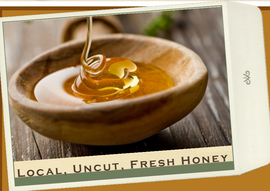
LOCAL, UNCUT, FRESH HONEY

Spring Del Rio Botanical honey is available in generous gallon jugs and is guaranteed not to be cut or mixed with sugar water or corn syrup.