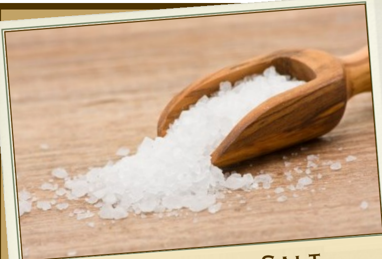
GIUSTO'S SEA SALT

Several weeks ago we introduced a new line of Natural and Organic Flours from San Francisco's Giusto's Specialty Foods . This week we are pleased to announce an additional item from Giusto's- Sea Salt .