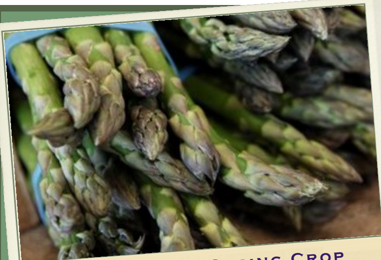
OUR FAVORITE SPRING CROP

The California asparagus acreage has dwindled over the past 15 years due to competition overseas and housing/commercial development in Southern California.